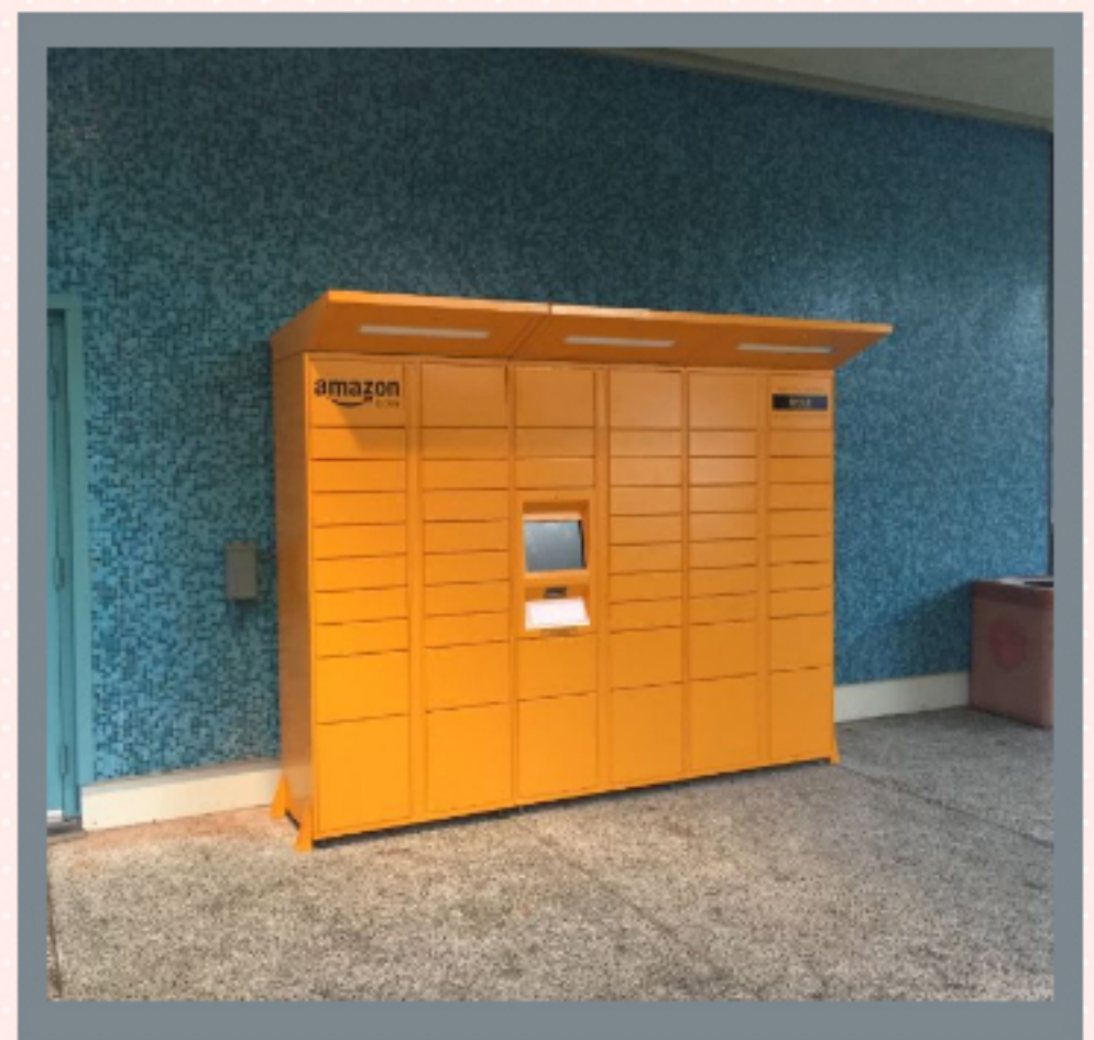
Amazon Locker Trout, located on Esplanade in front of the HPC.

6. Enter this code into the Amazon Locker and the locker with your package will magically open!